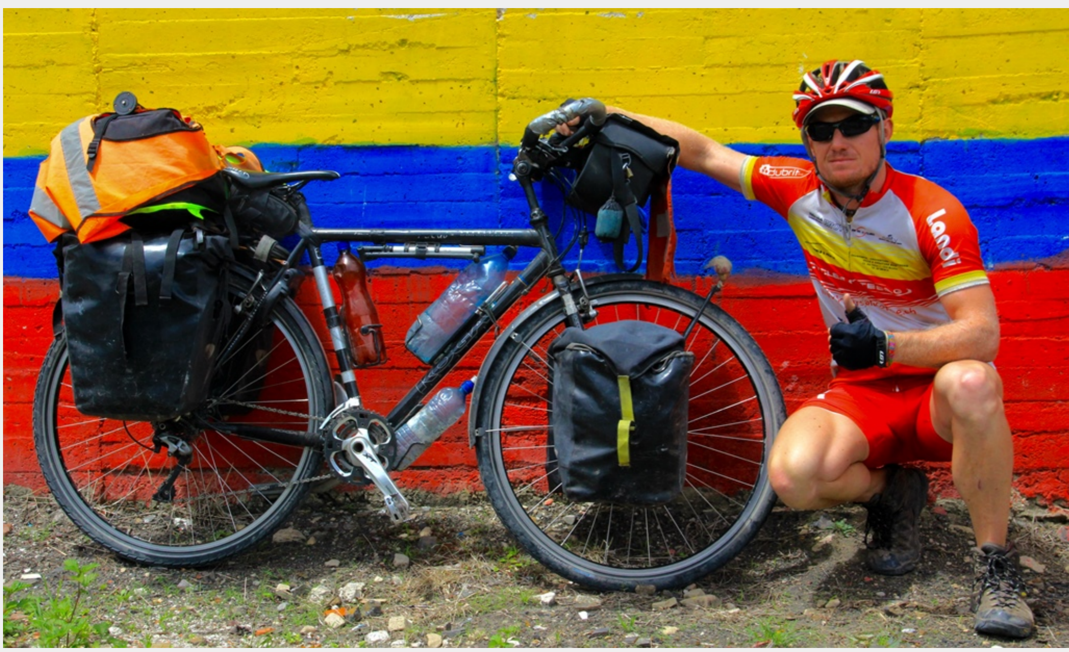
Ku igare rye aba afitemo ibikapu birimo ihema, ibiryo, amazi, ibiryamirwa, ibyuma byo gukora igare,... Aha yari Sierra del Cocuy -Colombia